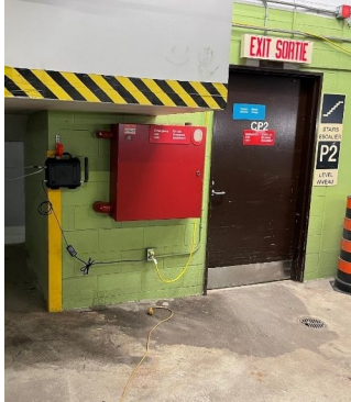
INFRA D10 connected to multiple sensors, to monitor sound and noise