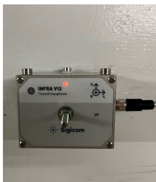
INFRA V12 monitoring vibration

Through meticulous planning, innovative solutions, and unwavering dedication to quality, GKM Consultants successfully executed comprehensive vibration and noise monitoring for the parking garage repair project. Their commitment to excellence and client satisfaction set a benchmark for future projects in the construction industry.