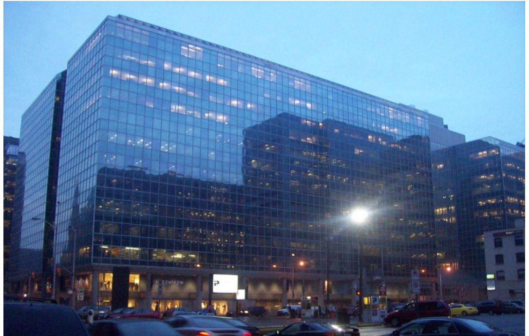
Sparks street underground parking and office floors: monitoring noise and vibration during construction work