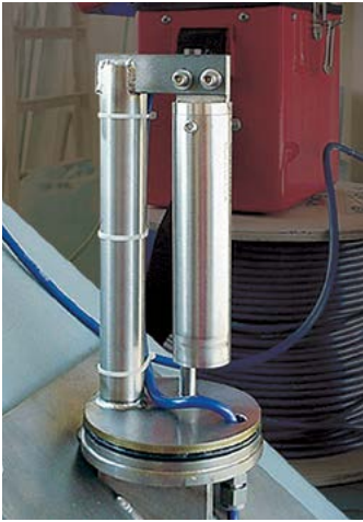
Model 6350 installation using a custom mounting bracket designed for concrete face rock fill dam applications (shown with protective cover removed).