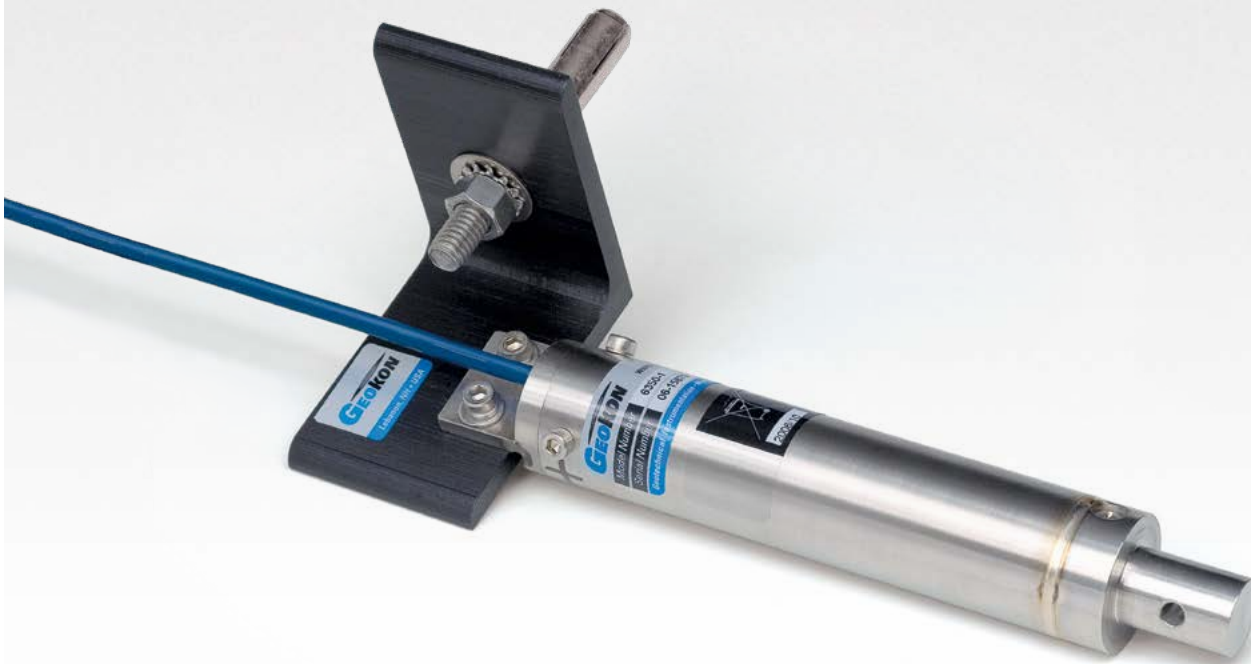
Model 6350 Vibrating Wire Tiltmeter shown with mounting bracket assembly.