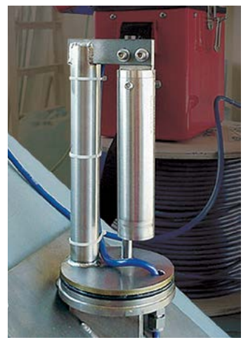
Model 6350 installation using a custom mounting bracket designed for concrete face rock fill dam applications (shown with protective cover removed).